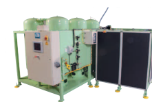
Helium Reclaim Gas Recovery System