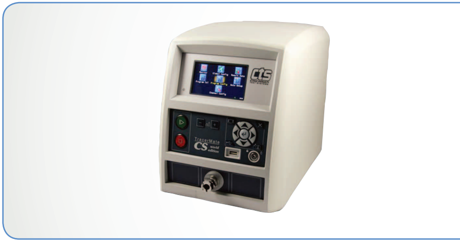
TracerMate CS Charging System

CTS 가 (TMRC) 300psig 6 TMRC 가 가 TMRC CTS 가