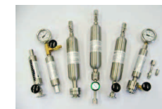
Gas Leak Standards