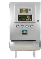
Tracer Gas Mixer